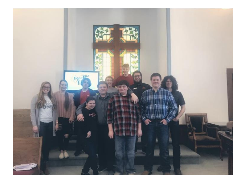
An incredible day at Ivy as the youth and their leaders led worship! We are thankful for all love and leadership we witnessed!