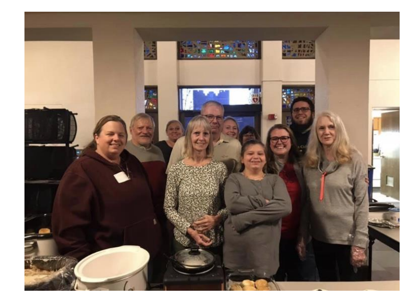
Ivy teamed up to serve dinner to the students at Simpson College