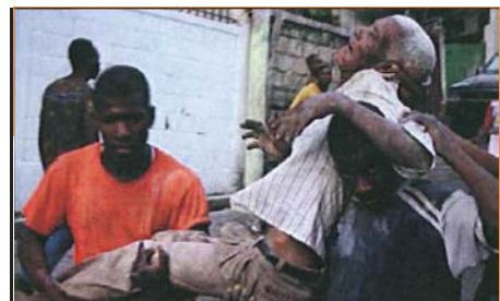
First aid: Residents carry an injured man through the streets of Port-au-Prince.