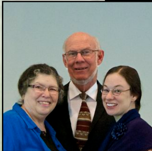
The Owens Family June 29 - July 2