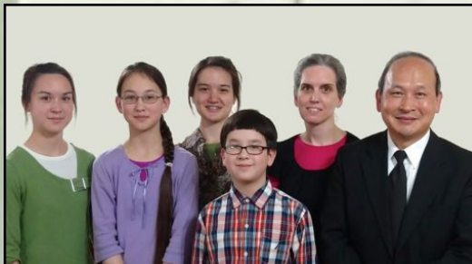
The Fall Family July 3 - 10